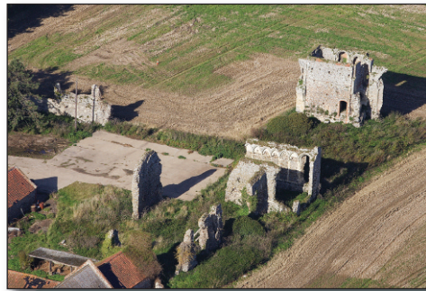
Bromholm Priory, Bacton