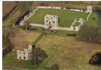
BACONTHORPE CASTLE The ancient Bacon family (since the castle's name) sold their estates here to the Heydon dynasty in the fifteenth century. The Heydon property began to build the fortified moated manor or castle around 1450. Only the two gatehouses and the outside walls remain, much of the building was demolished around 1650 when the Heydon family's fortunes declined.