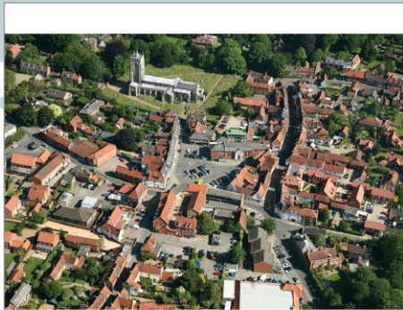
AYLSHAM Norfolk historic towns tend to have their parish churches close to their Market Squares. The church here contains the grave of architect and landscape gardener Humphry Repton (1752-1818). It was said he reduced his professional charges when he particularly enjoyed a project. When the Aylsham Navigation (1799) was open wharves came up here on the River Bure which greatly added to the prosperity of the town.